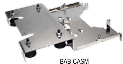
BAB-CASM Carriage Assembly for Beveling Base