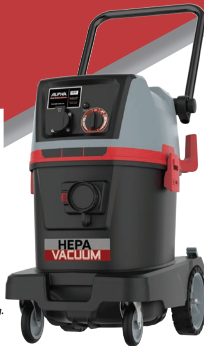
Constant high suction power during cleaning.