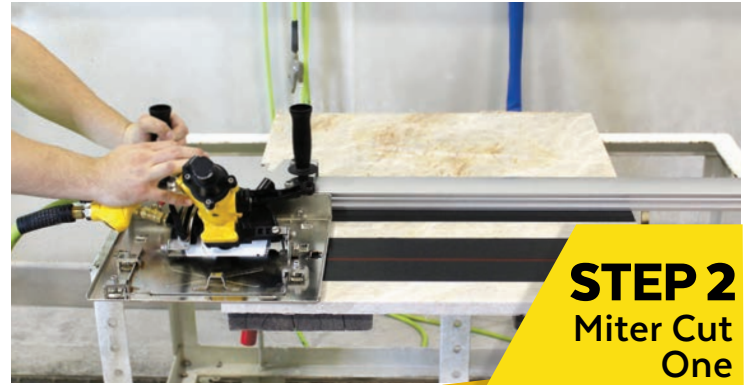
STEP 2 Miter Cut One