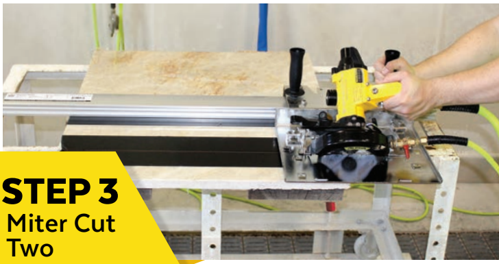
STEP 3 Miter Cut Two