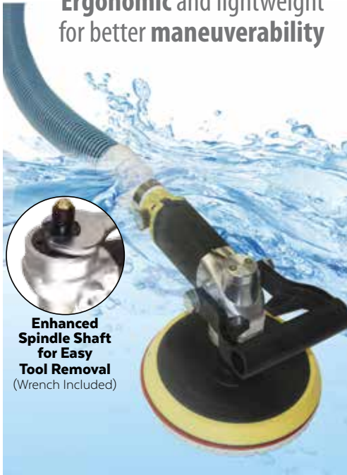
Enhanced Spindle Shaft for Easy Tool Removal (Wrench Included)