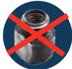
Special Connector NOT Needed