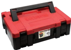
ATB000S 16"X12"X5" (402mmX302mmX126mm)