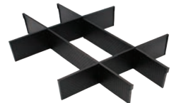
ATB0PIS 15.4"X11.3"X3.1" (392mmX288mmX80mm)