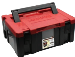
ATB000M 16"X12"X7" (402mmX302mmX166mm)