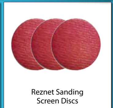
Reznet Sanding Screen Discs

See back for detailed product information.