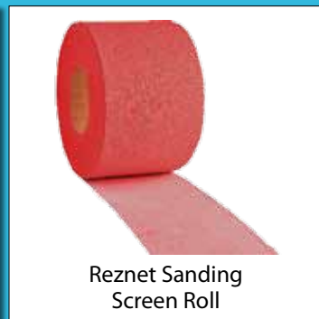
Reznet Sanding Screen Roll