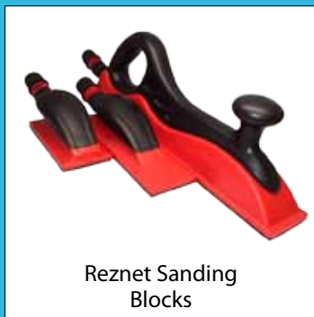
Reznet Sanding Blocks