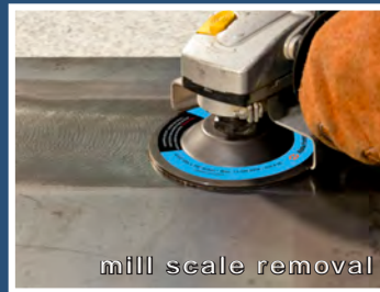
mill scale removal