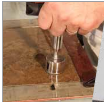
ELECTROPLATED DRILL BITS